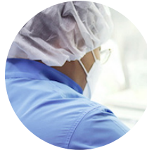
COMPLETE QUALITY CONTROL