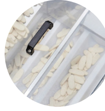
BLOCKING FOREIGN COMPONENTS